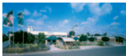
Silikal production and administration in Mainhausen, Germany.